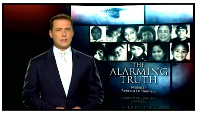
Part Two I 11 Minutes